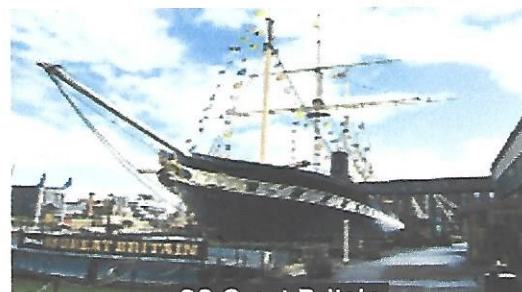
SS Great Britain

A deposit of £90 per person will secure your place on this tour. Please send your deposit cheque (made payable to Coach Trips from London Ltd ) to Graham Jenkins at 2 Wood End Gardens, Northolt, Middlesex UB5 4QH or phone Graham on 020 8422 2751 to pay your deposit by debit card or credit card. As usual, balances fall due eight weeks prior to the tour's departure.