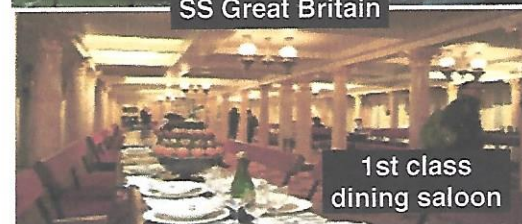
1st class dining saloon